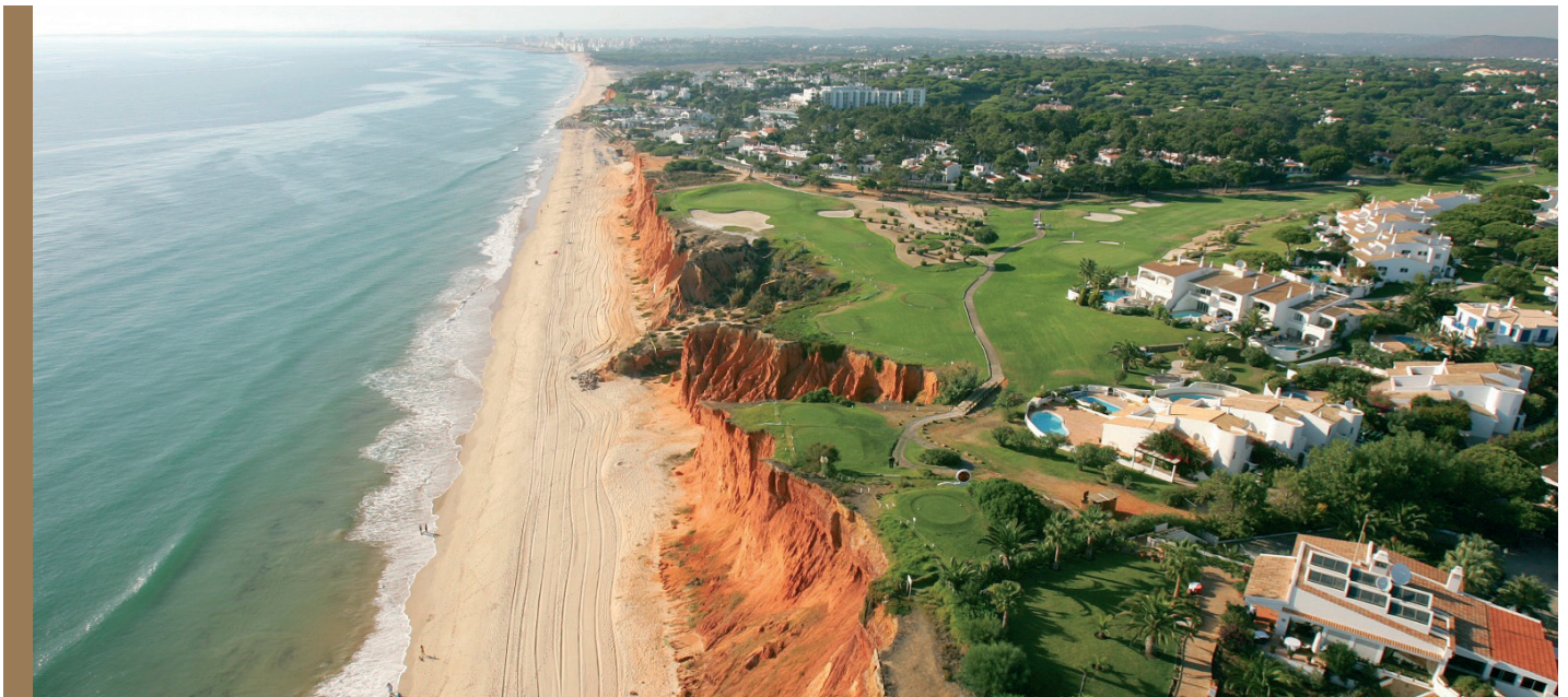
Vale do Lobo coastline

Located in the sunny Algarve, Vale do Lobo is only a short flight away! Just a 20 minute drive from Faro International Airport.