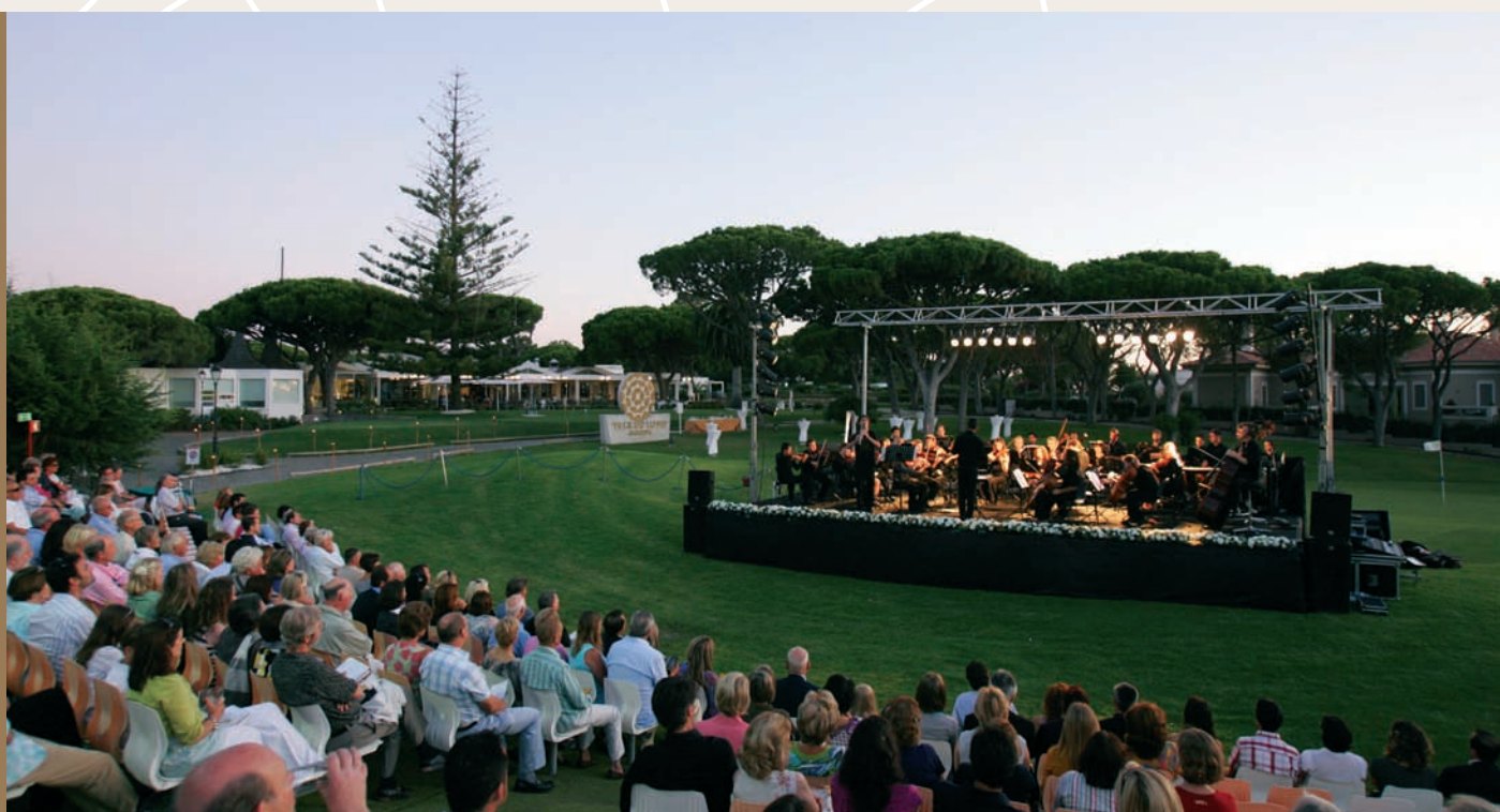
Summer favourite; the Concert on the Course – a classical concert by the Algarve Orchestra

Vale do Lobo's Events Calendar is complemented by a diverse line-up of regular sporting tournaments, including prestigious golf and tennis events, and high-profile sports training camps. The resort has also long been synonymous with providing an excellent location and extensive services for the ever changing needs of the MICE sector.