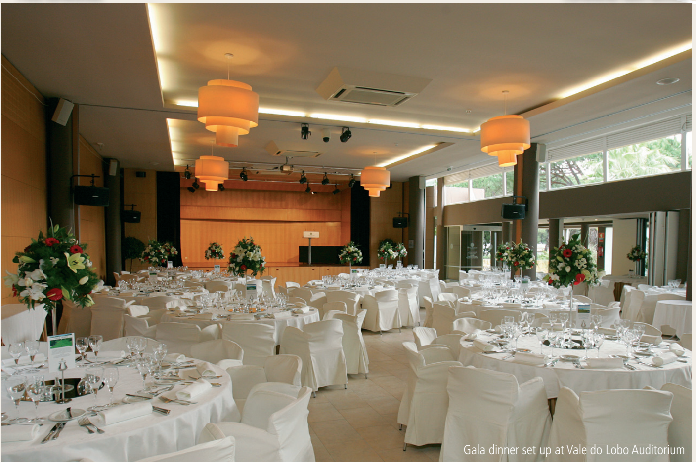
Gala dinner set up at Vale do Lobo Auditorium