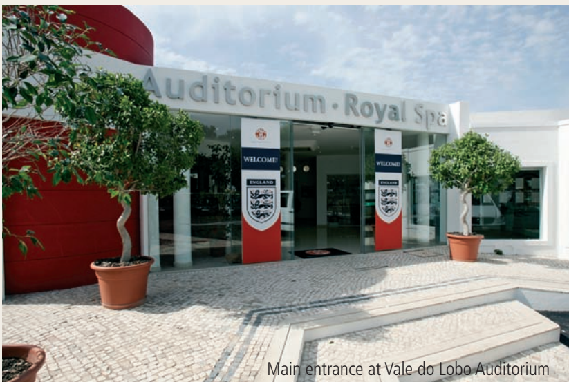
Main entrance at Vale do Lobo Auditorium