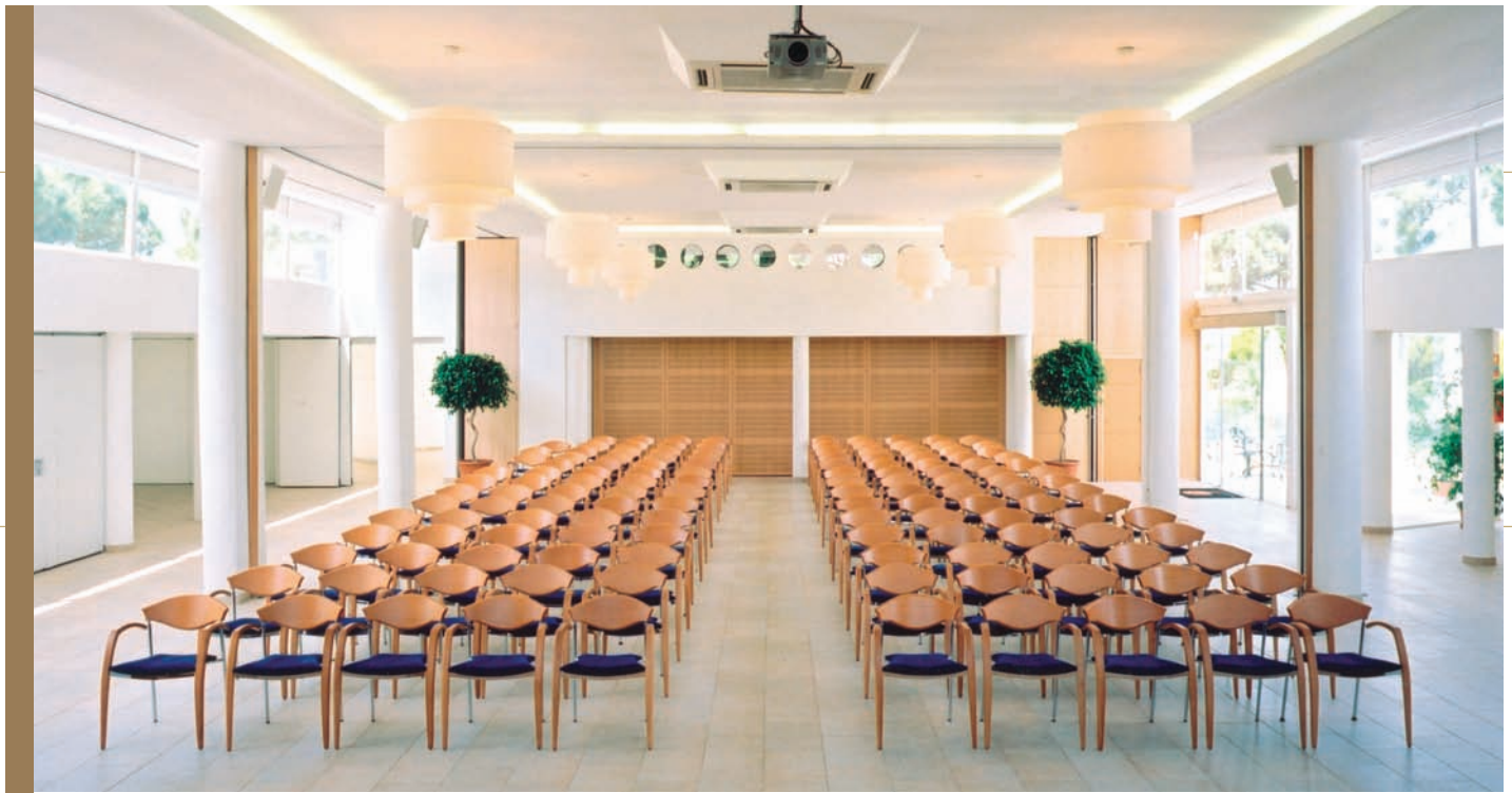
Conference room set-up