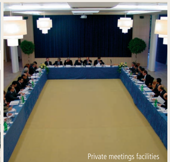
Private meetings facilities