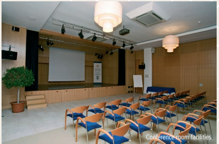
Conference room facilities