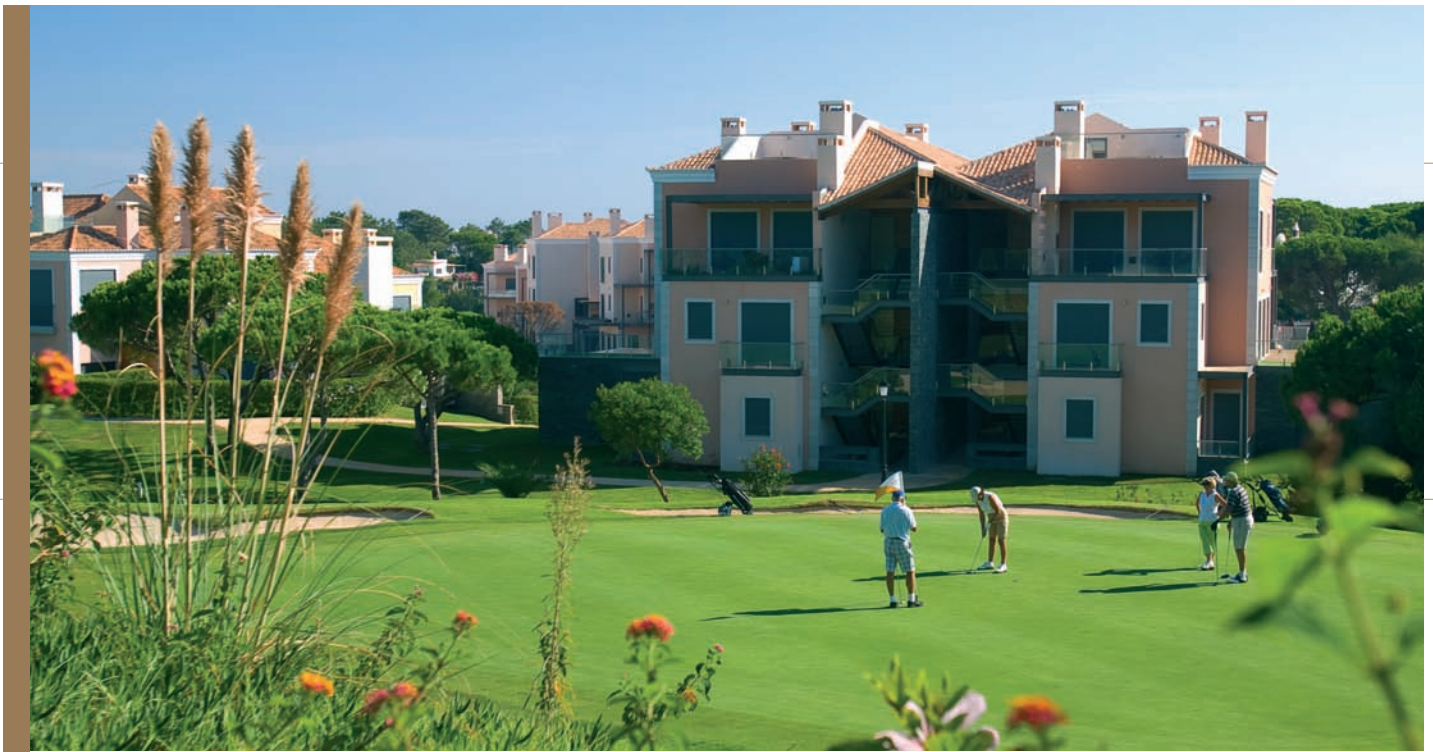
Royal Golf Villas